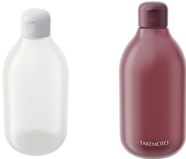
AOMPi-300 PR Flip-Top Cap