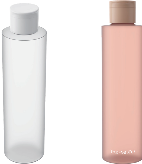
PPS-P200 P-SL Flip-Top Cap