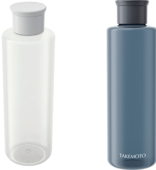
PEPISi-200 Pi III Flip-Top Cap